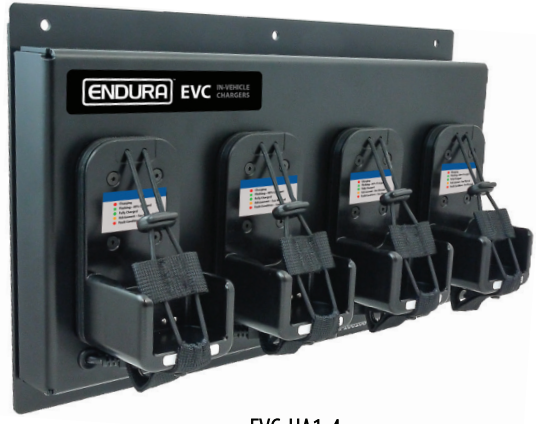
EVC-HA1-4 Rugged 4-unit model also available.